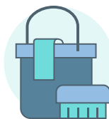
Mop or cloth and soapy water